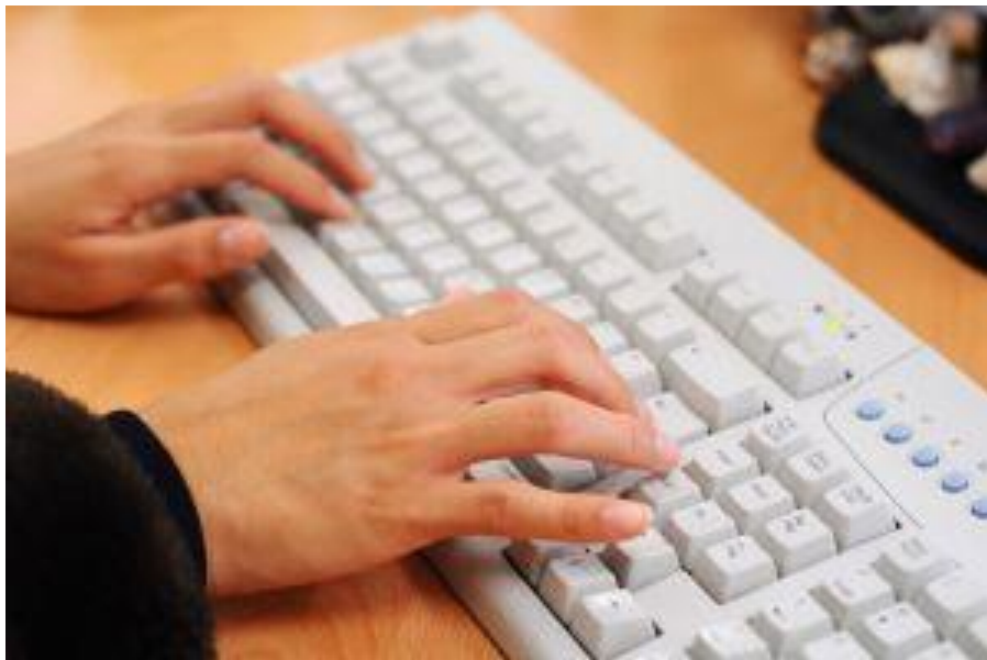
The Description 1

Using images will definitely contribute positively to the traffic movement towards a particular site. Therefore it would be prudent to have some knowledge on how this works and its positive contributing factors that facilitate the ideal traffic flow.